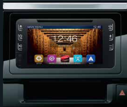
Audio Head Unit That well designed entertainment system with touch screen, DVD player, Toyota Navigation.

A fascinating audio experience that accompany your journey with Toyota Navigation System and Premium Sound.