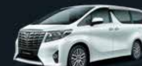
White Pearl MM