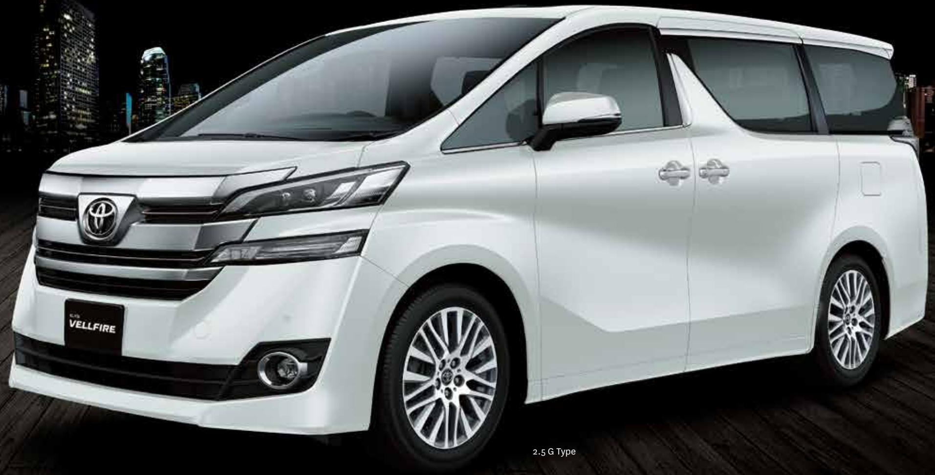
2.5 G Type