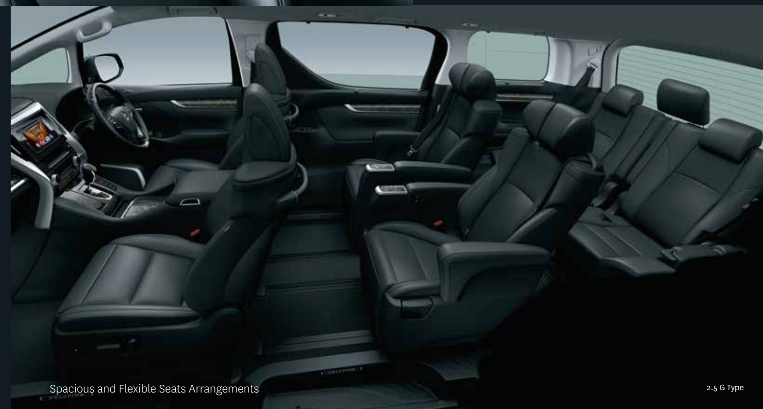
Spacious and Flexible Seats Arrangements