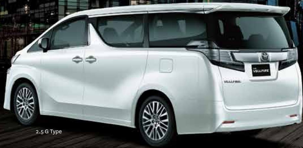
2.5 G Type