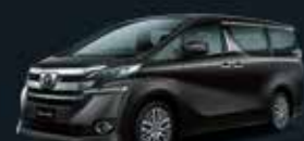
Burning Black Crystal Shine