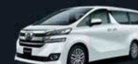
White Pearl MM