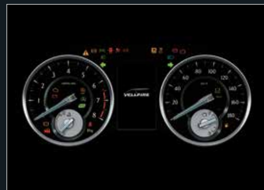
Multi Information Display That provide every information about your car. (2.5 G Type)