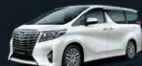
Luxury White Pearl Crystal Shine