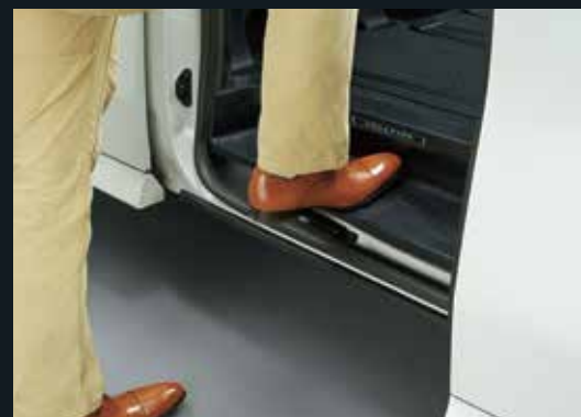
Step Illumination (2.5 G Type)

Excitement and satisfaction with new approach that exhilarating feeling of luxury.